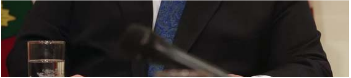
Ontario Premier Doug Ford on a conference call at Queen's Park on Friday, Feb. 26, 2021.

More than 300 physicians and health professionals are calling on Ontario Premier Doug Ford and Education Minister Stephen Lecce to keep the province's schools open for the rest of the school year.